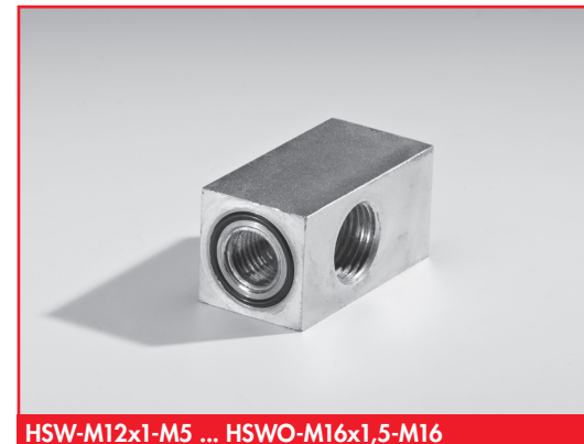
HSW-M12x1-M5 ... HSWO-M16x1,5-M16