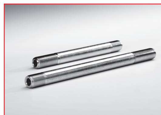
STI-M8x1 ... STI-M20x1,5