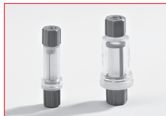
VFI-4 ... VFI 8