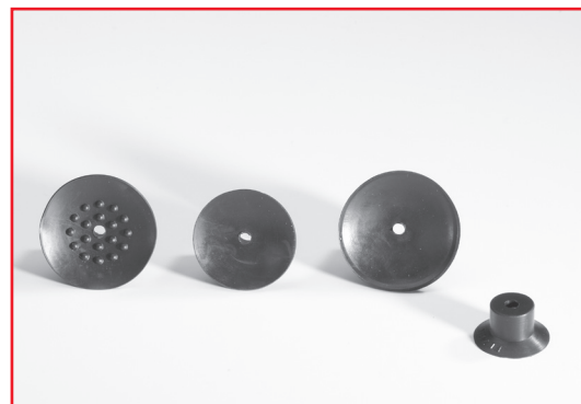
FS-G 10 ... FS-G 60, FS-GN38 ... FS-GN 47