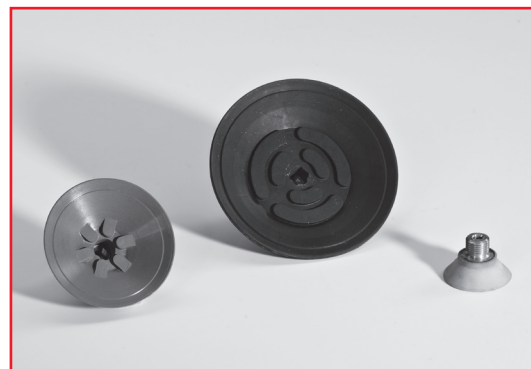
FS-GG 30 ... FS-GG 80