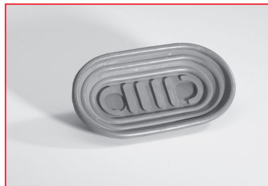
FS-GG 40x120 ... FS-GG 80x200