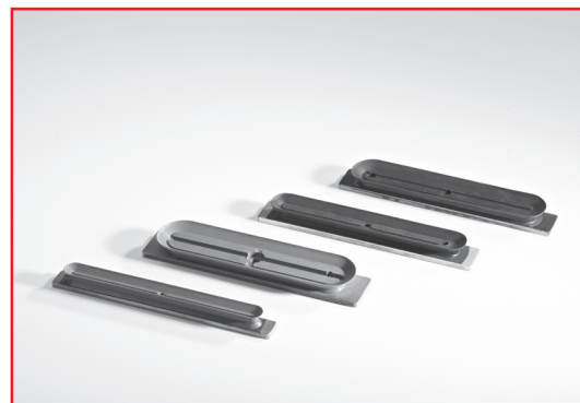
EP 30x100 ... EP 100x300