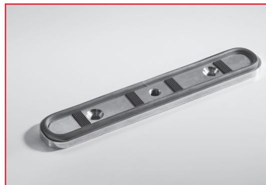
FSM 75x180 ... FSM 250x460