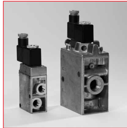
PEMV-1/8 ... PEMV-3/4