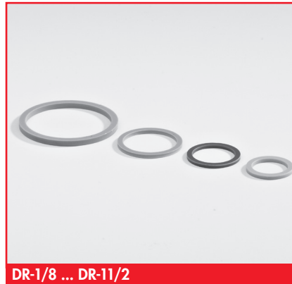
DR-1/8 ... DR-11/2

- sealing of hose nipples and connection elements