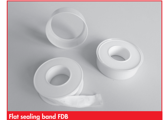
Flat sealing band FDB

- sealing of thread connections (winding contrary to thread direction)